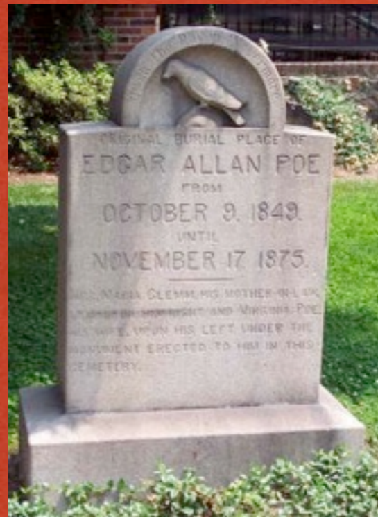
Headstone at Edgar Allan Poe's original grave. Mysteriously placed by Poe Toaster